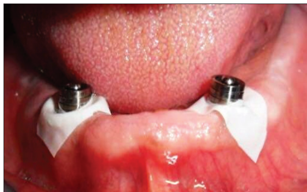
Figure 2: Metal housing placed on the ball attachment

was seated in the patient mouth. The resin was left to polymerize while the patient was closing in the centric jaw relation.