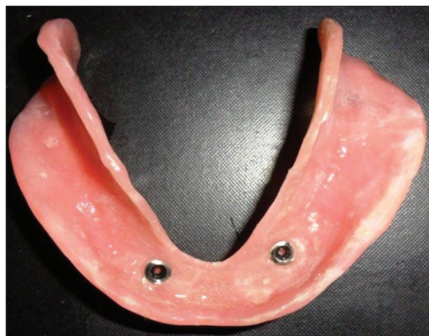
Figure 3: The fitting surface of the lower overdenture

Marginal bone loss measurements were as follows: A line tangential to the apex and perpendicular to the long axis of the implant was 1 st drawn, another line was extended from the alveolar crest to the 1 st line and was drawn tangential to the flutes of the implant on the mesial and distal aspect.